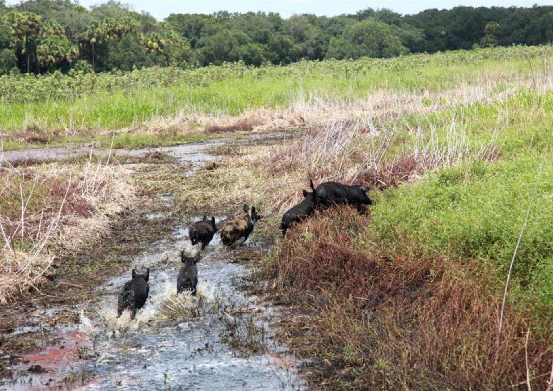
Feral hogs in the Phase I restoration area floodplain