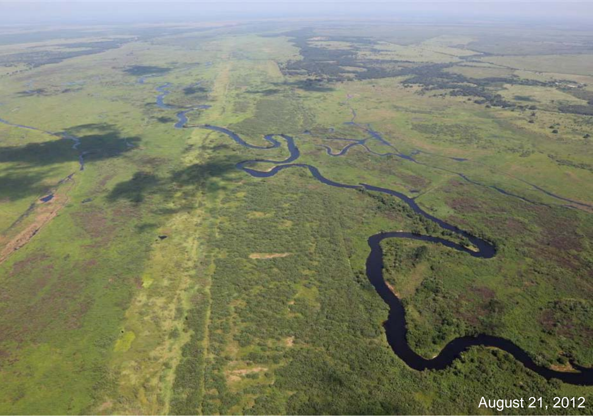
Same view one week before TS Isaac