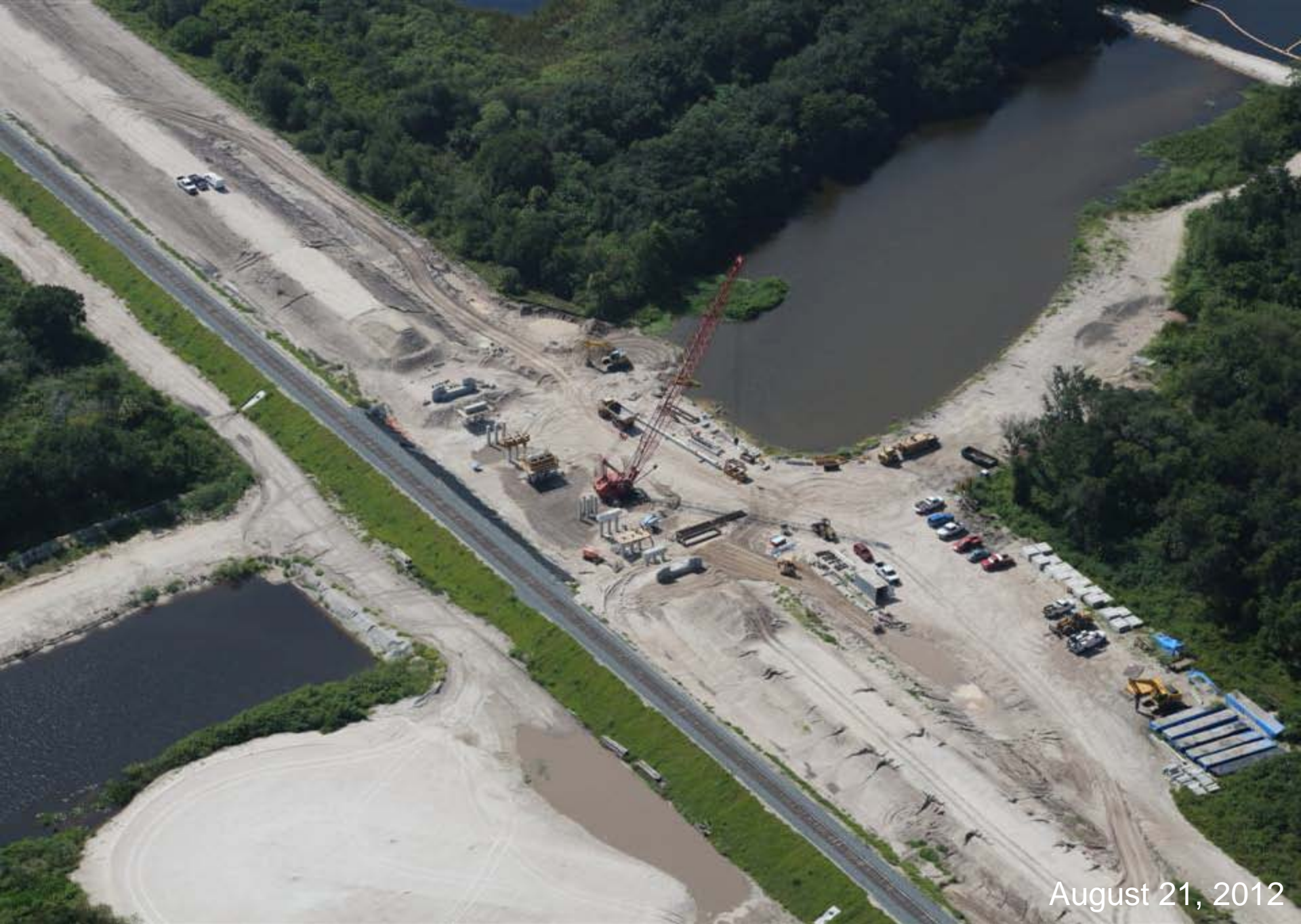
CSX Railroad bridge construction