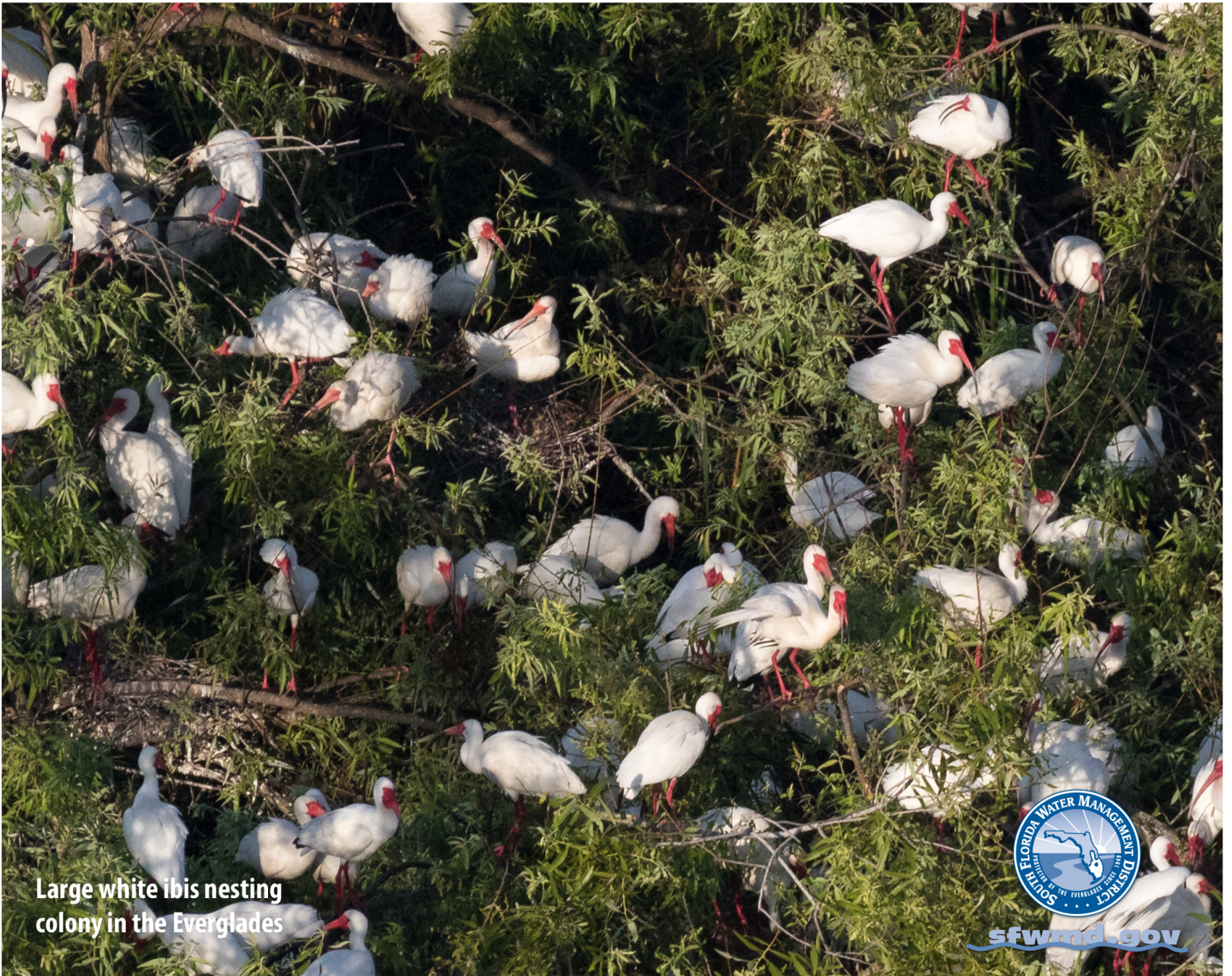
Large white ibis nesting colony in the Everglades