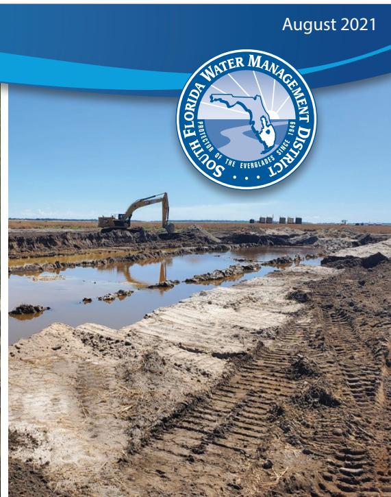
Excavating Fill Materials for Internal Berms – February 2021