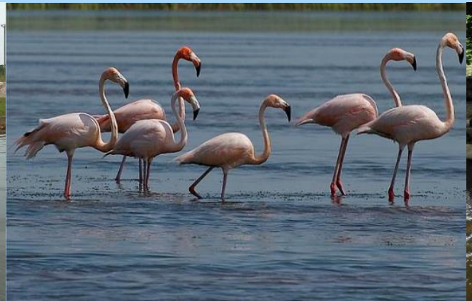
Improving Water Quality: Flamingos at Stormwater Treatment Area in Palm Beach County