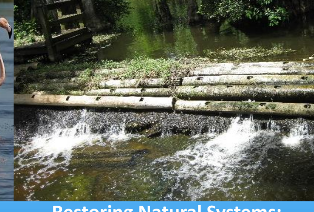
Restoring Natural Systems: Loxahatchee River Restoration