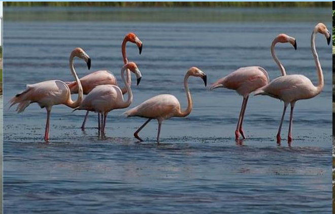
Improving Water Quality: Flamingos at Stormwater Treatment Area in Palm Beach County