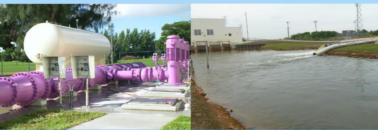
Ensuring Water Supply: Pompano Beach Reclaimed Water Supply Facility