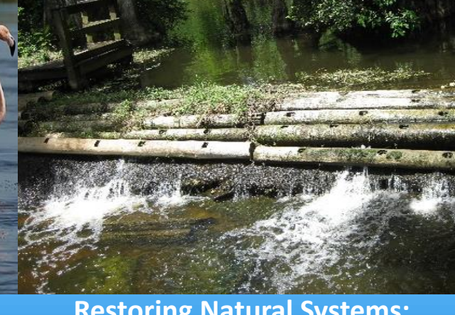
Restoring Natural Systems: Loxahatchee River Restoration