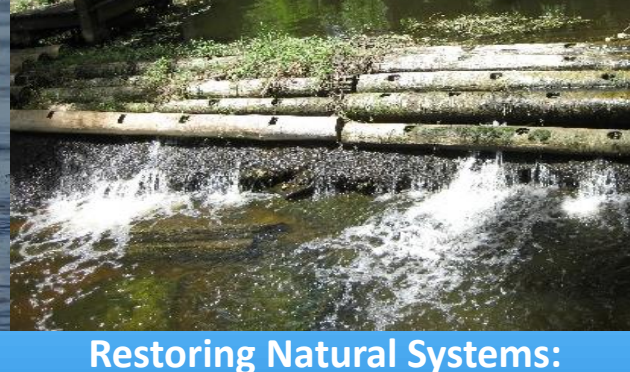
Restoring Natural Systems: Loxahatchee River Restoration