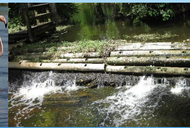
Restoring Natural Systems: Loxahatchee River Restoration