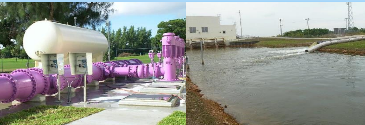
Ensuring Water Supply: Pompano Beach Reclaimed Water Supply Facility