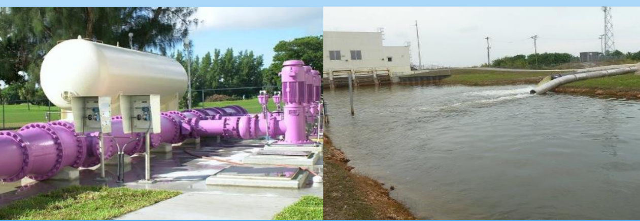
Ensuring Water Supply: Pompano Beach Reclaimed Water Supply Facility