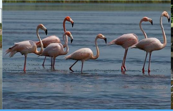
Improving Water Quality: Stormwater Treatment Area in Palm Beach County