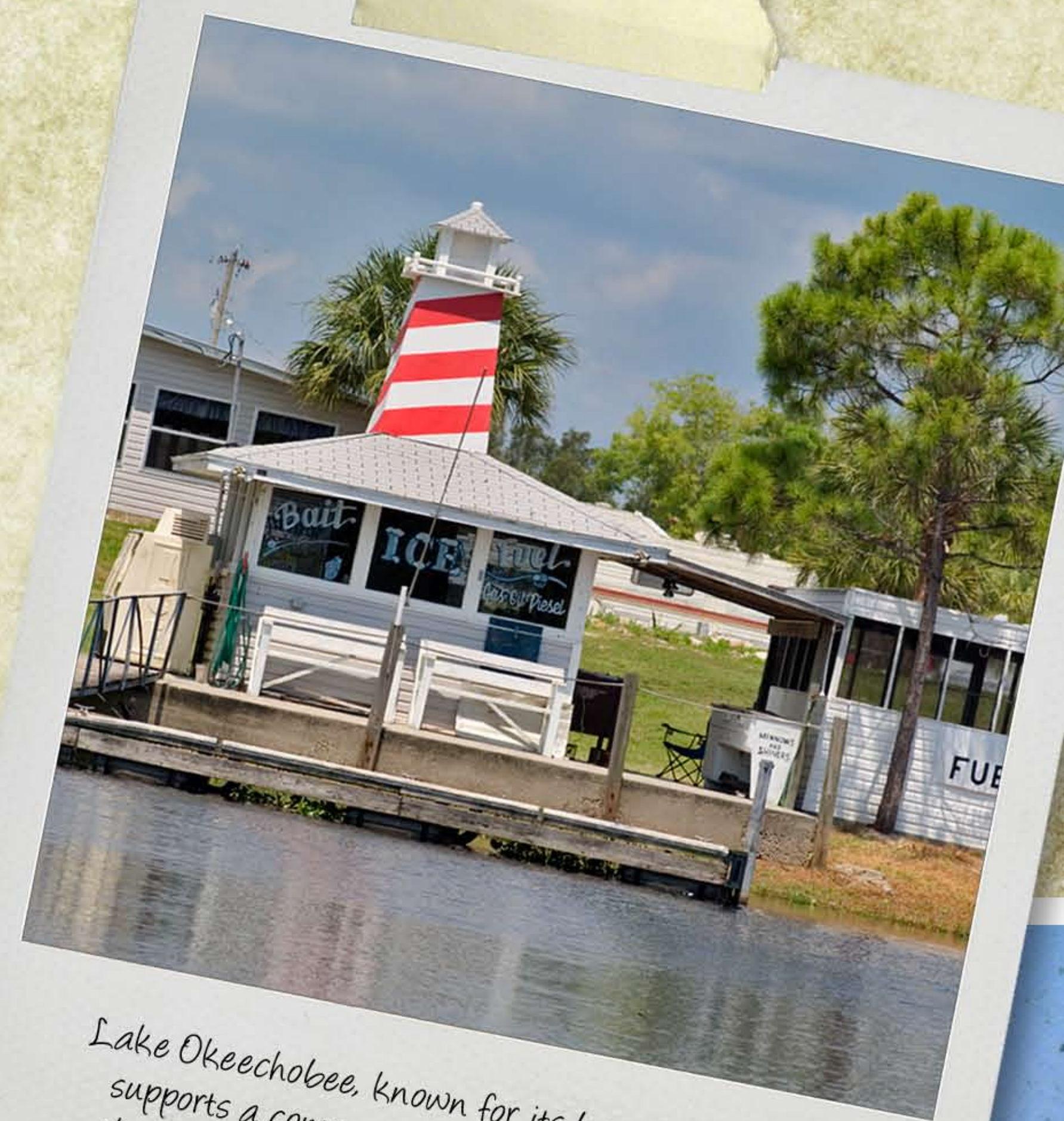
Lake Okeechobee, known for its bountiful fishing, supports a commercial fishing industry and is the site of many tournaments for sportfishing.