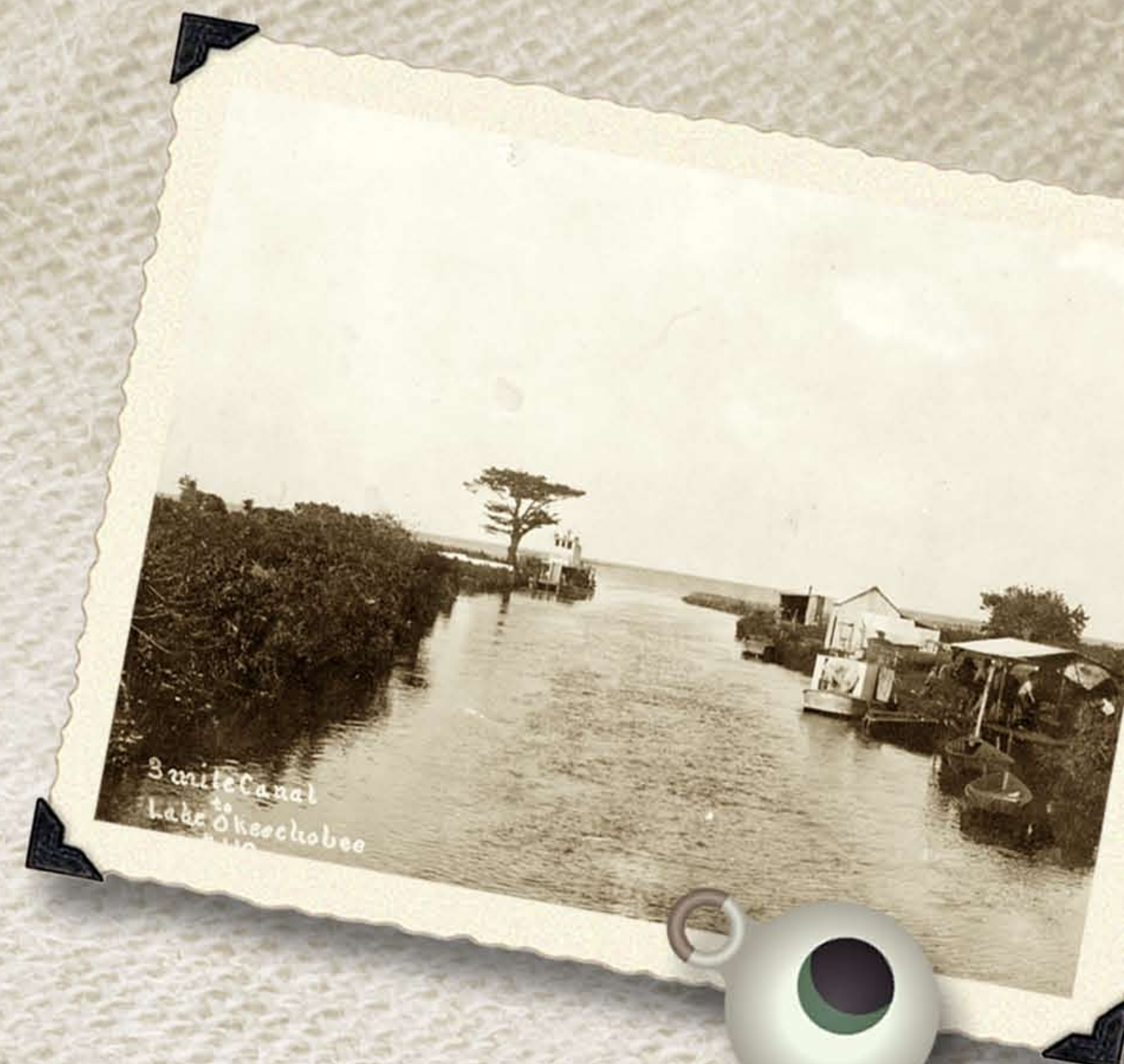
Above: Steamboat "Suwanee" in the Three-mile Canal to Lake Okeechobee. The only steamer operating through the heart of the Everglades, the "Suwanee" made regular trips between Ft. Myers and Ft. Lauderdale, traveling through the Caloosahatchee, Lake Okeechobee and the North New River Canal, early 1900s.

Catastrophic hurricanes in 1926 and 1928 killed thousands of people and caused millions of dollars in damage, prompting the government to step in to improve water control structures to protect farms as well as the region's population.