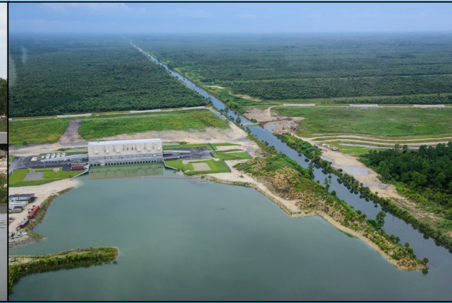
Faka Union Pump Station