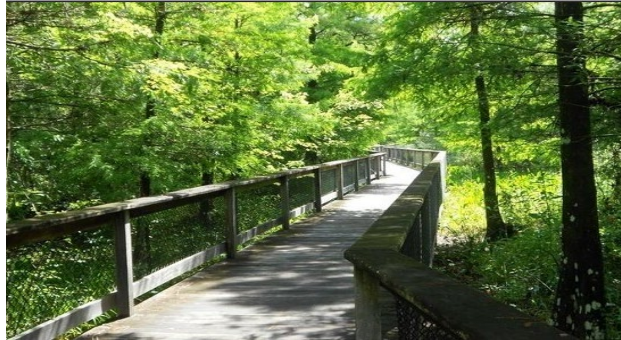
Bird Rookery Boardwalk