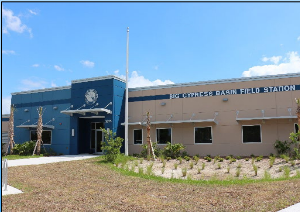
Big Cypress Basin Field Station