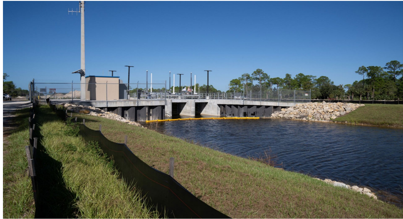
Cypress Canal Structure Ribbon Cutting