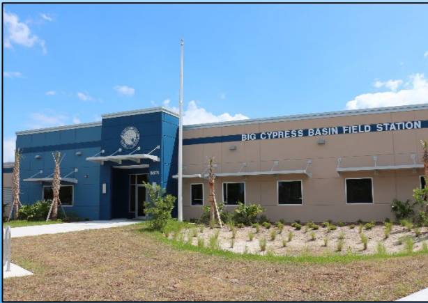
Big Cypress Basin Field Station