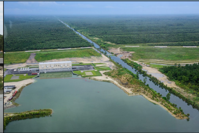
Faka Union Pump Station