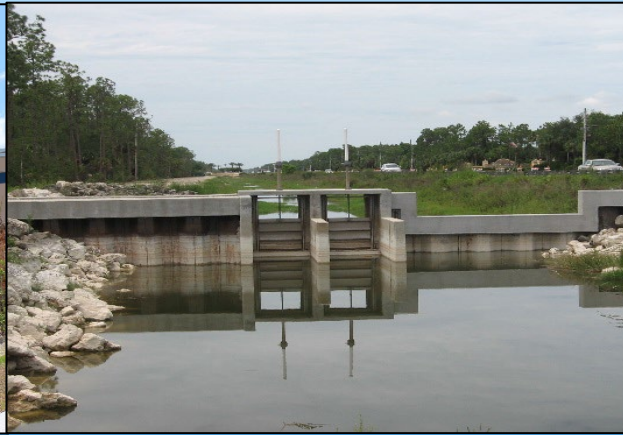
Henderson Creek Structure 2