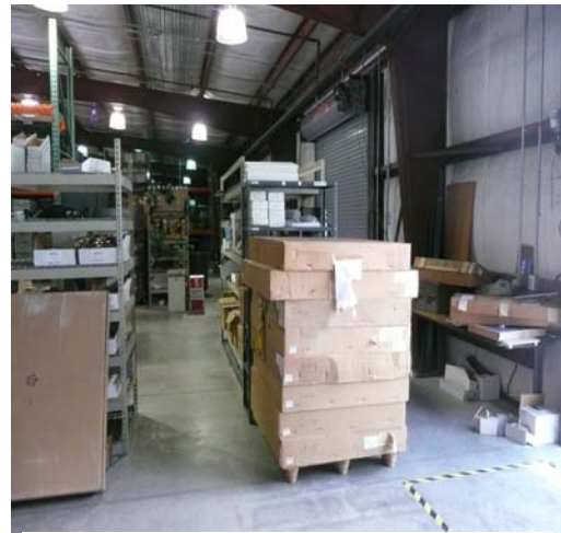
District Parts Warehouse

Rotables are entered into SAP inventory records when received, and must be “asset tagged” within three days of receipt. Contractors no longer provide any rotatable or most consumable materials except for miscellaneous supplies for installations or repairs, but rather, all such items are to be supplied by the District warehouse, as reflected in the Statements of Work. The reason being 1) equipment installations and repairs can remain standardized if all the parts and components are from a single source, and 2) consumable items can be better controlled and accounted for, and there is less likelihood of a contractor over - billing for parts.