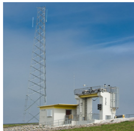
Remote Gate Structure

The Instrumentation Management and Data Collection section is responsible for the maintenance of the SCADA sites. The section has 25 full time employees and also utilizes the equivalent of 10 additional personnel supplied under maintenance contracts with 9 different contractors. According to the SCADA Instrumentation and Telemetry Maintenance Database (SCADA Site Information Report), the following represents a breakdown of the active and inactive SCADA sites which are serviced by a combination of contractors and District employees.