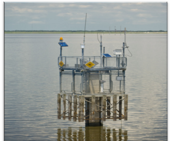
Monitoring Station on Lake Okeechobee