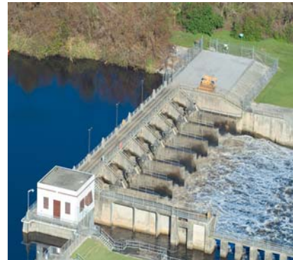
Gate Structure on C-44