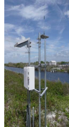
CR 10 Data Logger

The SCADA components support and maintain the following types of hydrologic, meteorological, and water quality monitoring sites: